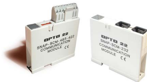
SNAP Serial Communication Modules

Both SNAP serial communication modules work with SNAP PAC Ethernet-based brains and rack-mounted controllers, both standard wired models and Wired+Wireless™ models. (They do not work with serial-based SNAP PAC brains.) These modules snap into Opto 22 SNAP PAC mounting racks right beside digital and analog